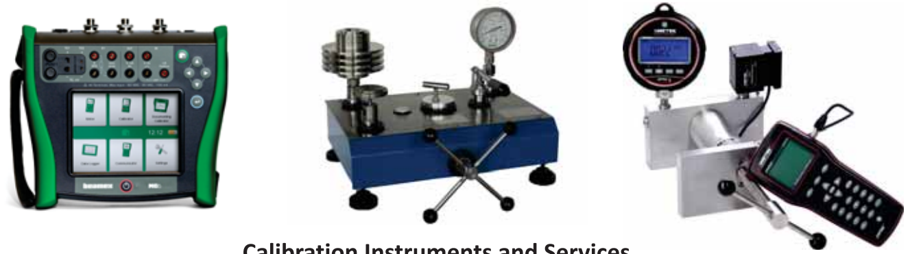
Calibration Instruments and Services

*NOTE : PICTURES USED ARE FOR REPRESENTATION PURPOSE ONLY*