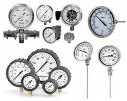
Pressure and Temperature Gauges