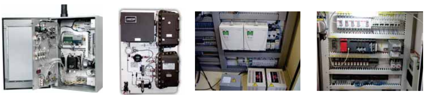
Analyzer and Instruments Panel