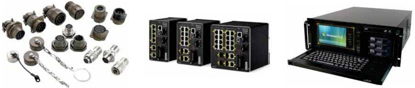
Industrial Connector's, Switches and PC