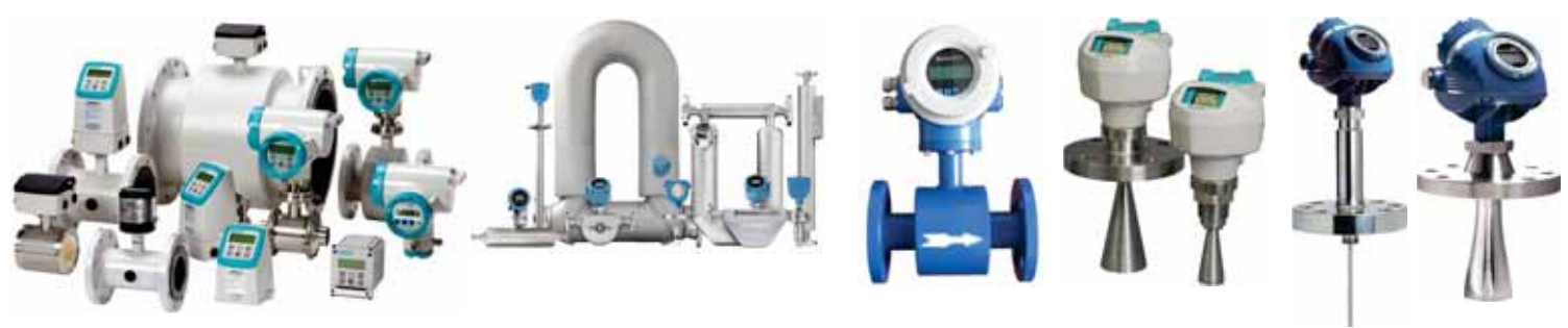
Flow and Level Transmitter