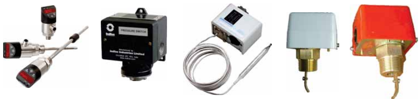
Pressure, Temperature and Level Switches