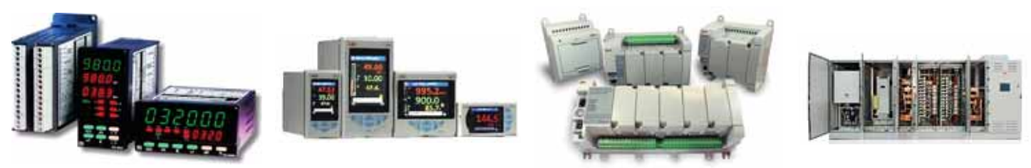
Process Indicator, Controller, PLC and DCS System