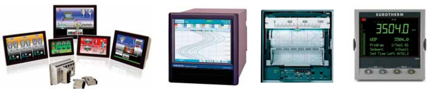
HMI and Recorders

*NOTE : PICTURES USED ARE FOR REPRESENTATION PURPOSE ONLY*