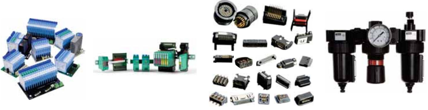
Isolators, Converters, Connectors and Instruments Fittings