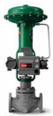
Final Control Element