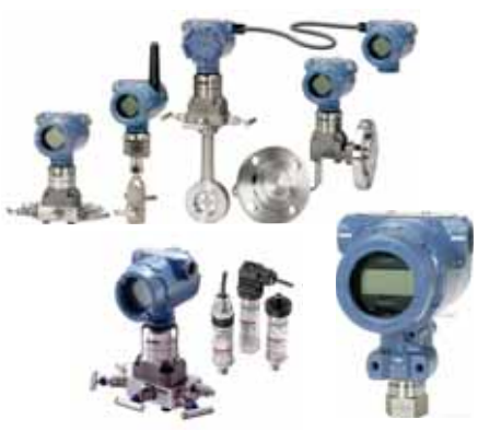
PT, FT and DPT Transmitter